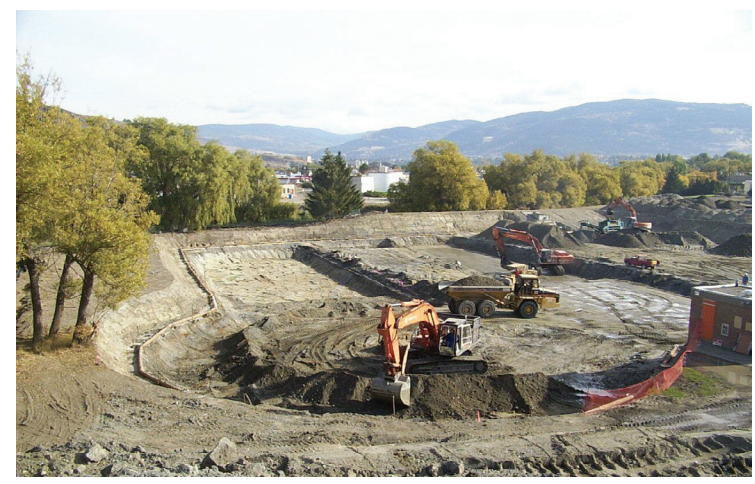
A perimeter dewatering system for the construction of a new waste water treatment plant in one of Excel's areas of expertise

A current major project is Kelowna's Lakeshore Drive upgrade, a four-month job for Excel that is seeing the installation of a new trunk sewer as well as a new bridge across Mission Creek. Depending on how critical the job is, an employee will man the pumps.