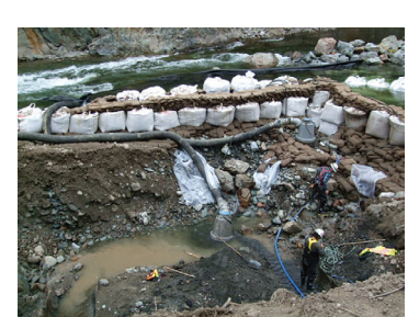
Excel does river diversions and dewatering for new fresh water intake structures

The Kelowna General Hospital expansion is a recent large project where Excel had to pump water away from the building site for the foundation. Excel also has considerable expertise with earth dam remediation.